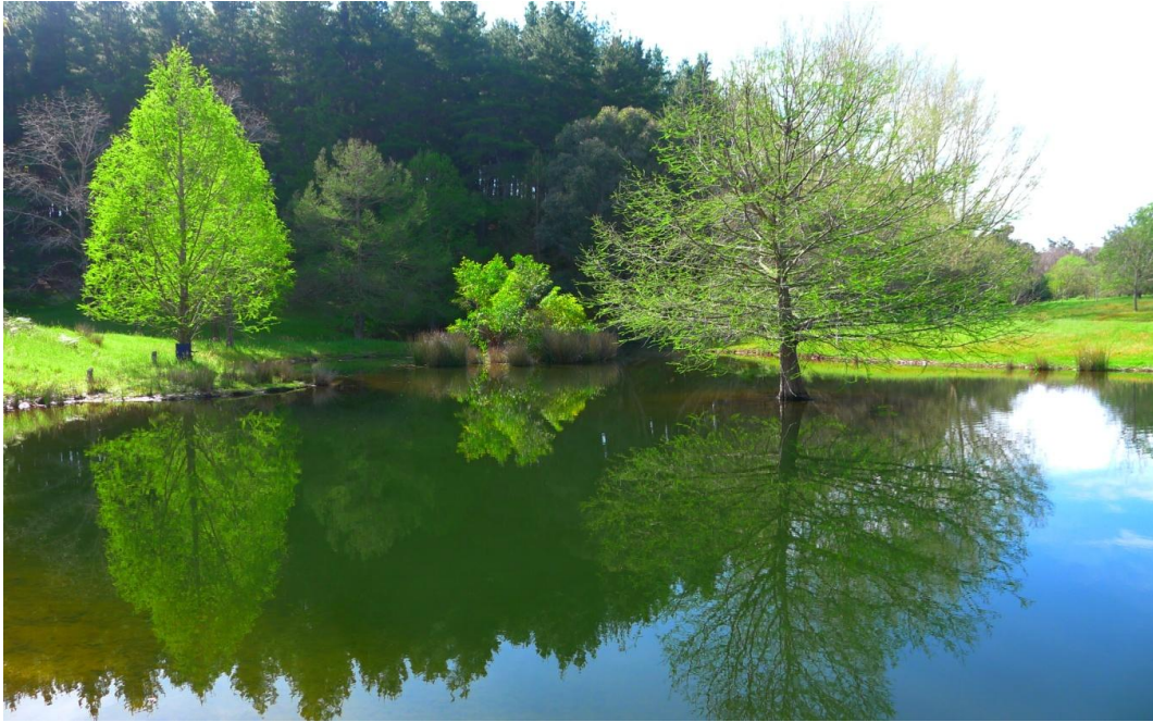
Spring leaf flush at the Duck Dam with Dawn Redwood & Swamp Cypress. (On the Sequoia Short Walk.)